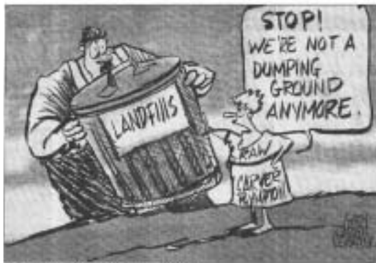
Residents Against Waste say Carver has had enough.